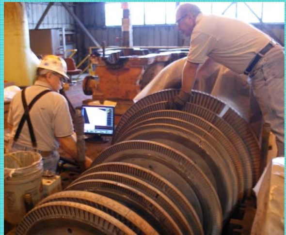
Photo above: A team of technicians conducts the phased array ultrasonic testing on the FWA CHPP Turbine #5 rotor.

We will not be publishing the Transition Update next week due to the transition ceremonies on Wednesday, Thursday and Friday. We will send out the next update on Friday, August 22nd.