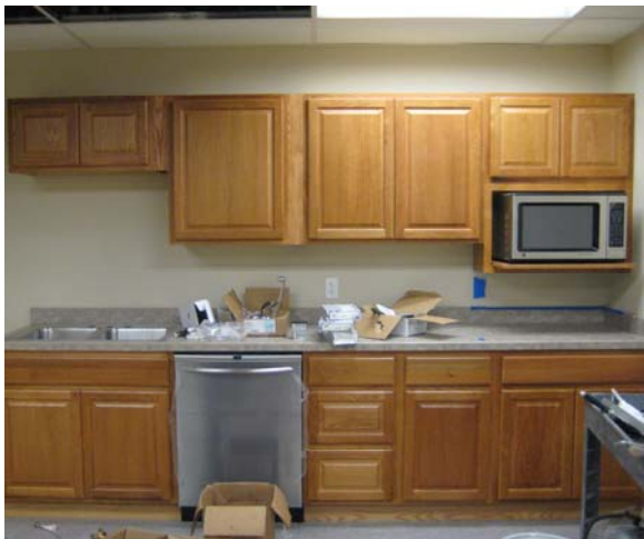
Kitchen at FWA Depot