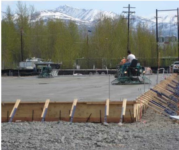
Operation Depot Pad