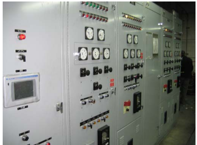
Above: The Black Rapids Distribution Switchgear will be expanded and its capacity increased to allow for additional electrical capability at Black Rapids.