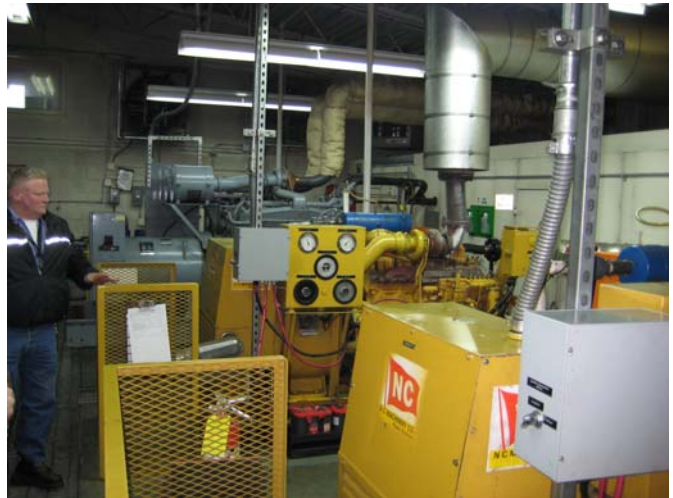
Above: Black Rapids Generator upgrades will allow all units to run in a synchronized fashion.